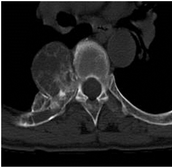
Figure 1 CT reveals a lytic lesion in right fifth posterior rib with ossified matrix.

clinic history, the initial imaging impression was osteochondroma.