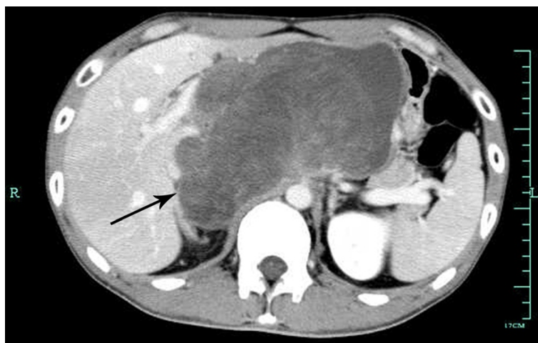
Figure 1 Abdominal computed tomography showing a huge tumor occupying the entire retroperitoneal space.

All imaging studies and serology examinations indicated that surgery was feasible. At surgery, a huge, soft, whitish, solid and cystic tumor was found, which occupied the entire abdomen. The tumor appeared to involve the distal stomach, the diaphragm, the hepatoduodenal ligament, the gastrohepatic ligament, the left lobe of the liver and the celiac trunk. It was also compressing the walls of the abdominal aorta and the inferior vena cava. Massive varicose veins were noted in the abdominal cavity. Part of the left lobe of the liver was resected due to tumor infiltration. A distal gastrectomy with a Billroth II anastomosis was simultaneously performed due to tumor involvement of the stomach. In addition, we suspected that the common bile duct had also been invaded by tumor, which was not evident on preoperative imaging, and we therefore performed a resection of the common bile duct, a cholecystectomy and T-tube drainage. Intraoperative histological examination of a frozen section suggested the presence of a soft tissue sarcoma.