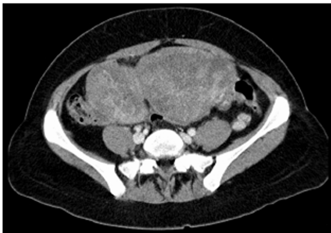
Figure 1 CT scan showing two very large ovarian tumors in the lower abdomen.

A 41-year-old woman presented to our surgical outpatient clinic with hypermenorrhea, followed by amenorrhea and discomfort in the upper abdomen with nausea and emesis. Gastroscopy and histology revealed a poorly differentiated primary gastric mucus-producing adenocarcinoma with numerous signet-ring cells in the distal corpus and the antrum. CT scan showed extensive tumor in the lower abdomen, which appeared to be an ovarian tumor or, as a differential diagnosis, a Krukenberg tumor (Figure 1). Endoscopic ultrasound of the tumor resulted in a uT3, N+ stage. Elevated tumor markers like CA 19-9 (817.7 U/ml, normal range: 0.0–37.0 U/ml), CA 72-4 (92.4 U/ml, normal range: <4.0 U/ml) and CA 125 (151.4 U/ml, normal range: <30.2 U/ml) were also present. Virilization was absent at the time of the initial diagnosis. Surgery was not