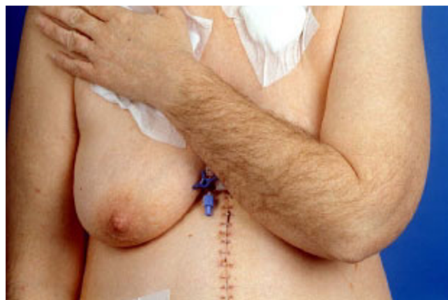
Figure 2 Extensive increase of body hair and muscle mass of the premenopausal patient.